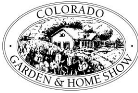
EXHIBIT DISPLAY RULES AND REGULATIONS

The following Exhibit Display Rules & Regulations are designed to assist you in the construction of your exhibit. Read these guidelines carefully in order to avoid timely and costly delays on show site.